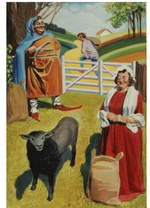
Baa Baa Black Sheep. Illustration for Ladybird Book of Nursery Rhymes